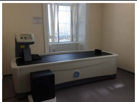
A DXA scanner

The DXA scanners are situated at the Grampian Osteoporosis Service, Ground Floor, Ashgrove House, Foresterhill, Aberdeen, AB25 2ZA. We also have a mobile DXA scanner