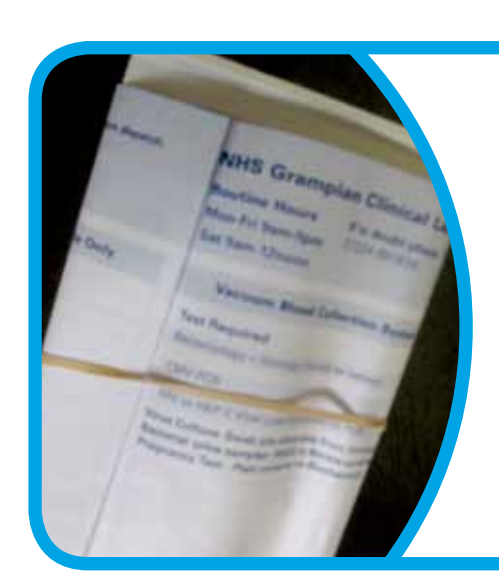
Put the form around the holder.