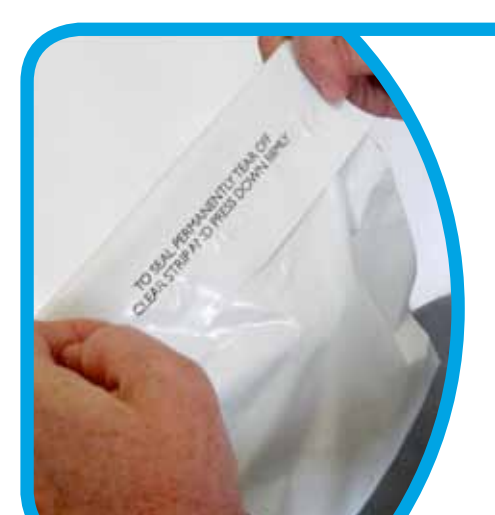
Close the bag.