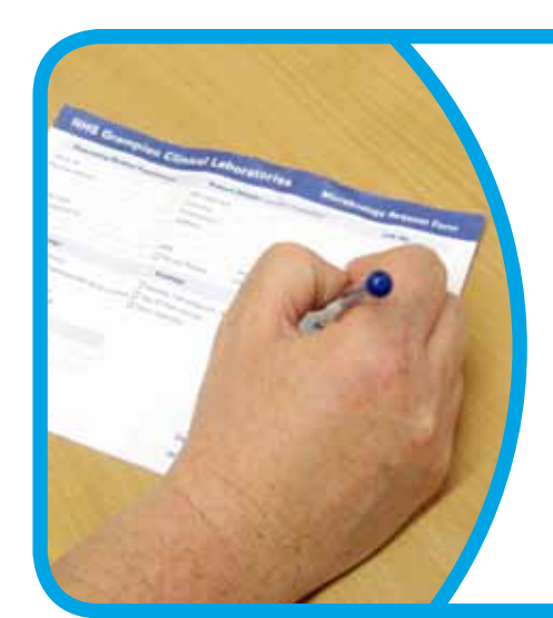
Fill in the form. Get someone to help you.