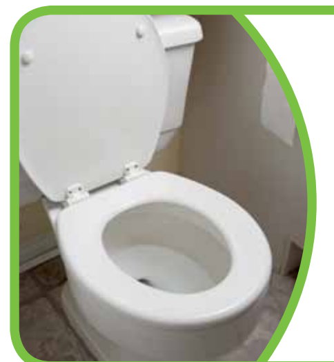
When you go to the toilet, pee in a clean container.